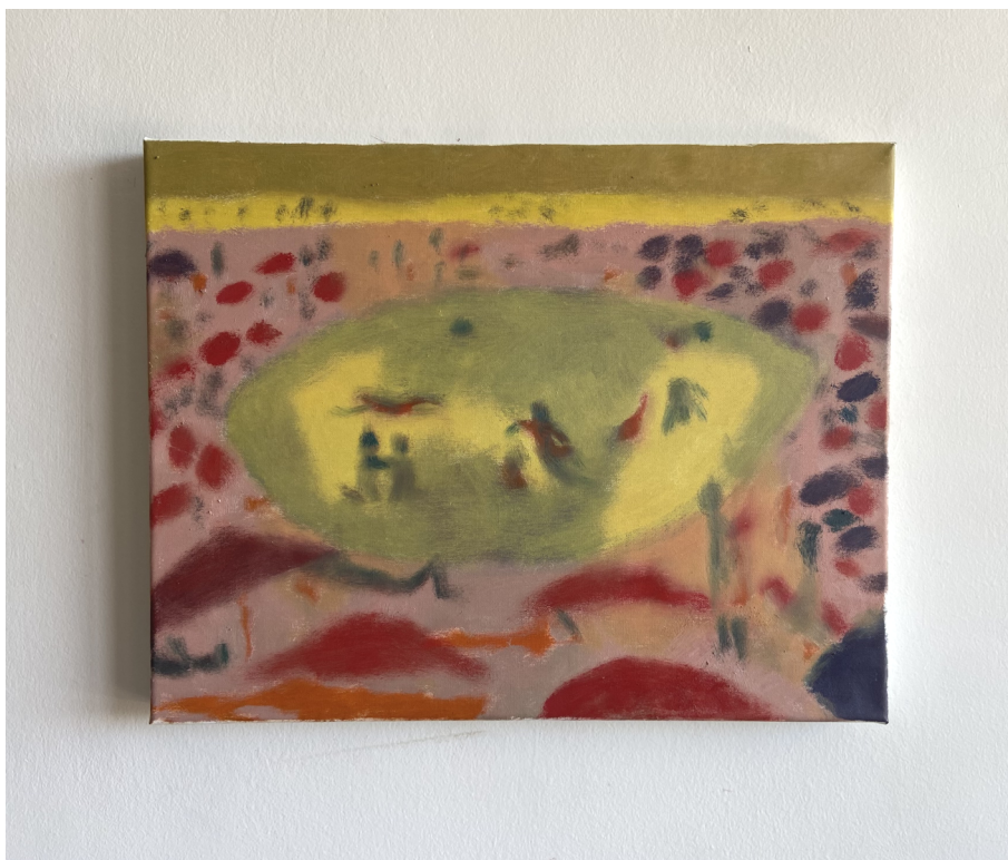
Piscininha , 2025 oil on linen 35 x 45 cm unique